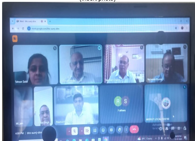
Audience in Lecture Meeting