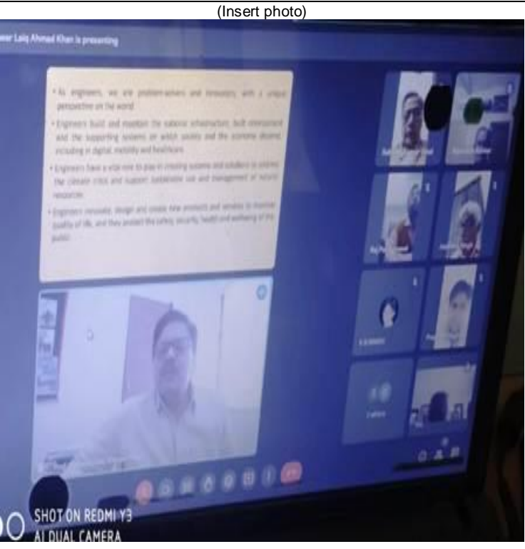
Title of photo: Some of the attendees in the webinar